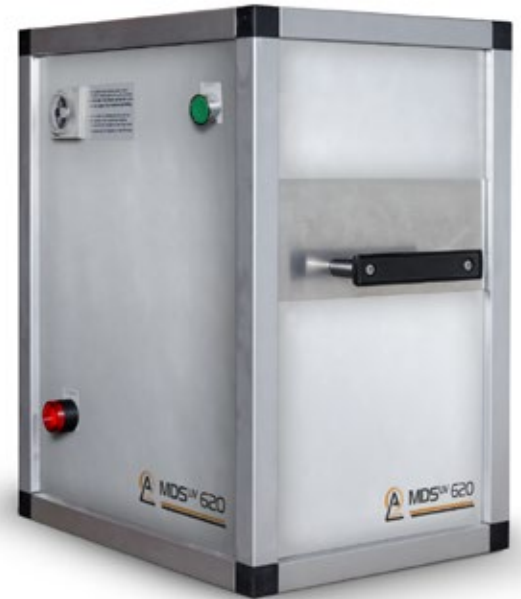
AL SYSTEMS - MDS-UV-620 MANUAL DECONTAMINATION SYSTEM