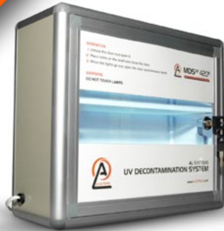
AL SYSTEMS - MDS-UV-420R MANUAL HIGH-VOLUME DECONTAMINATION SYSTEM