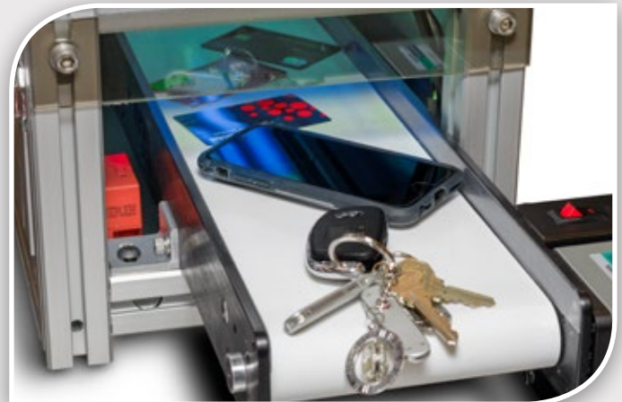
AL SYSTEMS - ADS-UV-620 RETRIEVE ITEMS FROM CONVEYOR