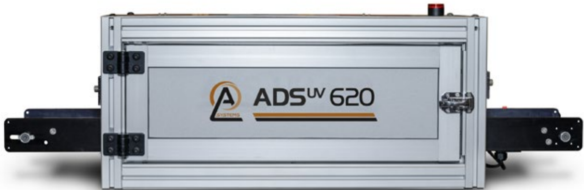
AL SYSTEMS - ADS-UV-620 SEMI-AUTOMATED DECONTAMINATION SYSTEM